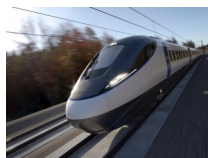
Government awards HS2 rolling stock contract