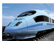
HS2 - Making the case for the whole Eastern Leg of HS2