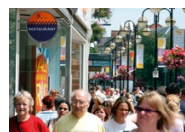
EU Settlement Scheme quarterly statistics