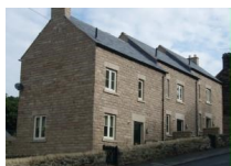
Brownfield Land Release Fund