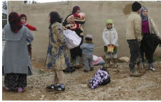
East Midlands responds to the migration crisis