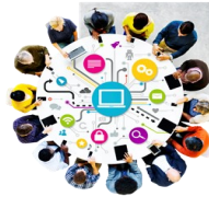
EMC HR Bulletin, October 2020