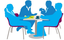
EMC Events for Councillors and Officers