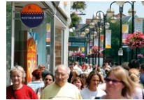
Levelling Up, Housing and Communities Committee report on High Streets