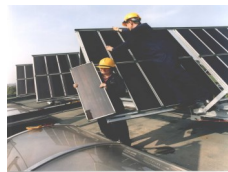
Housing and Energy Efficiency Councillor Workshop