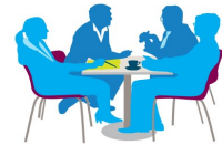
EMC Events for Councillors and Officers