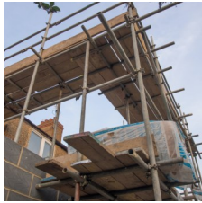
Levelling Up and Regeneration Bill