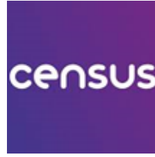
Census 2021—How has the East Midlands