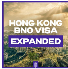
Hong Kong BNO Visa expanded