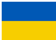
UK Support for Ukrainian Refugees