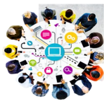
Local Government Apprentice of the Year 2022