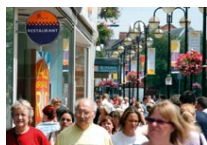
Lateral Flow Device Shared Learnings Workshop