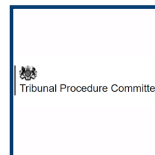
Age assessment processes consultation