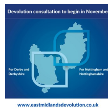
Government confirms commitment to EMCCA