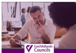
EMC Membership Survey 2023