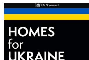
£150m to assist Ukrainian families into own homes