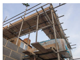
Second round of towns fund cancelled