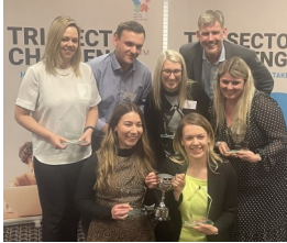
EAST MIDLANDS CHALLENGE 2023