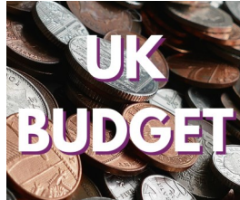
SPRING BUDGET ANNOUNCEMENTS