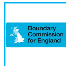
Final chance to have your say on boundary review