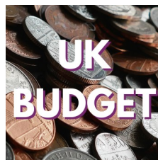
Key takeaways from the autumn statement