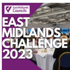
East Midlands Challenge 2023