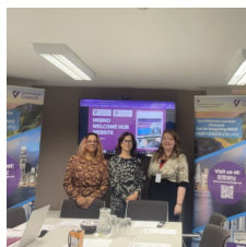
HKBNO focus group in Nottingham