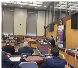
East Midlands Councils Nomination Process