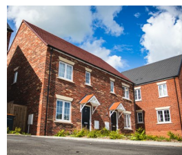
Research into the supported housing sector