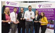
East Midlands Challenge 2023