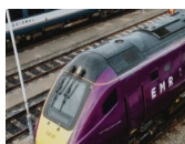
Government signs multi-year collaboration agreement with TfEM