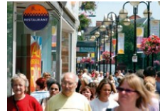
£226 million package to support vital bus services