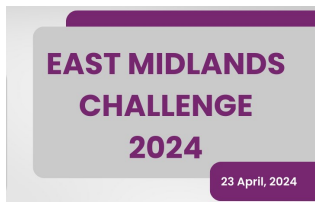
East Midlands Challenge 2024