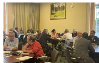
Upcoming EMC Training courses