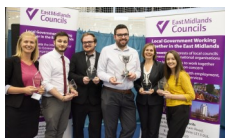
East Midlands Challenge 2023