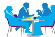
EMC Events for Councillors and Officers