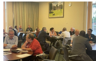
Upcoming EMC Training courses