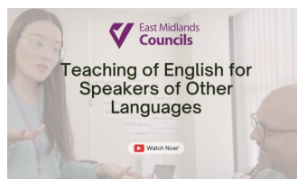
Project to train migrants and refugees as English Teachers extended