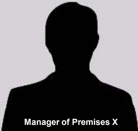
Manager of Premises X